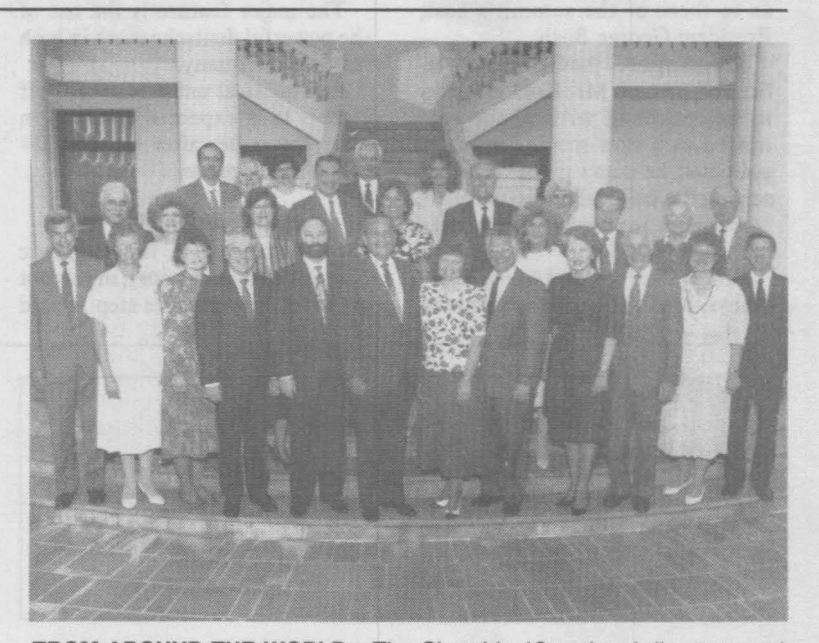
FROM AROUND THE WORLD—The Church's 12 regional directors and their wives gather for the annual regional directors conference in Pasadena June 26 to 29.

'Well, that need has pretty much (See REGIONAL DIRECTORS, page 6)